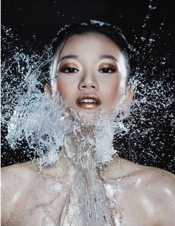
Skin: KETT's cosmetic hydroproof foundation; Lorac Pro Eyes: Motives by Loren Ridinger shadows: Elle paint pot, Sweet Chocolate. Estee Lauder Mascara, MakeUp ForEver Aqua Seal Lips: Motives by Loren Ridinger paint pot Elle, MakeUp ForEver Aqua Seal